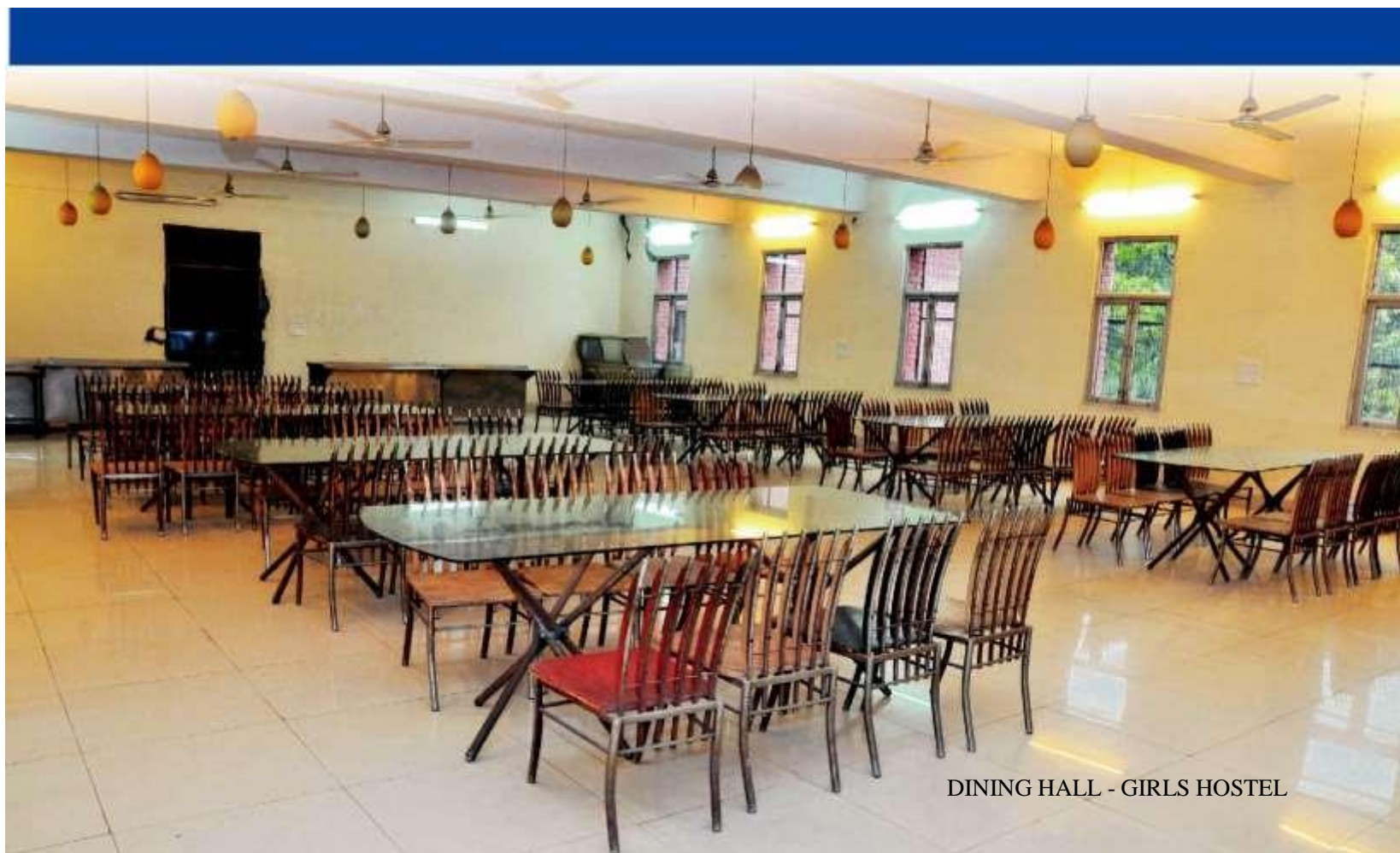
DINING HALL - GIRLS HOSTEL

3.11.h. Any student admitted to the Hostel who changes his/her course of study in the College ceases to be a resident of the Hostel.