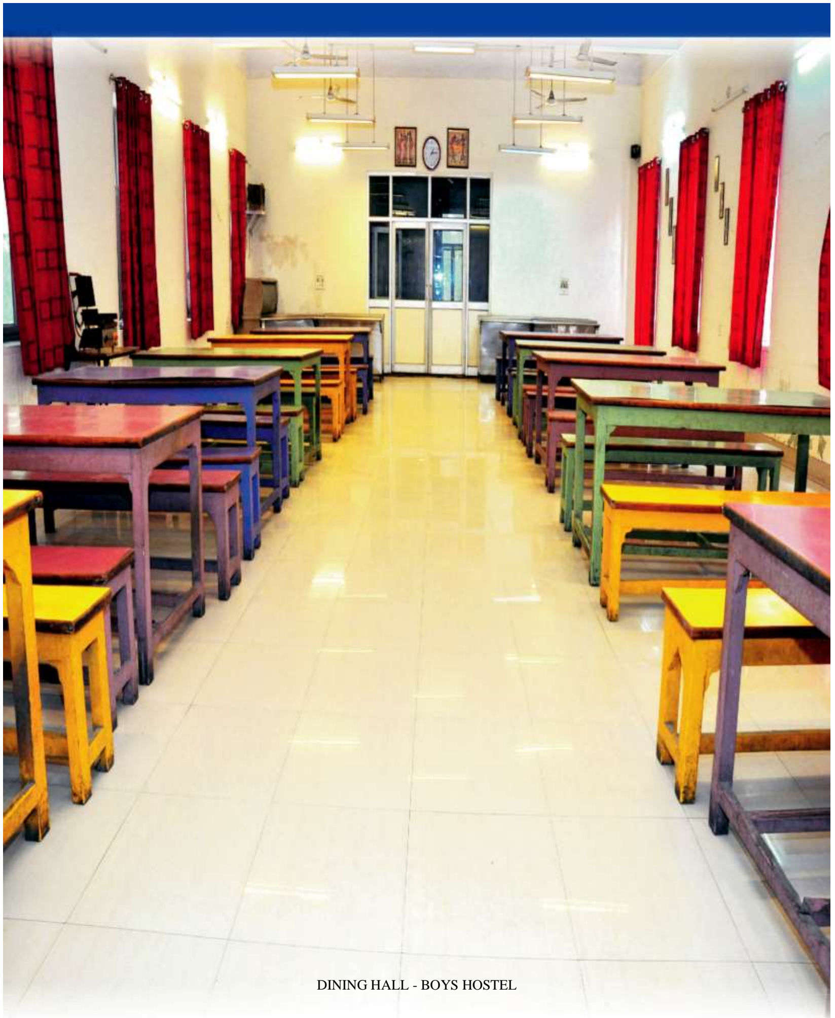
DINING HALL - BOYS HOSTEL