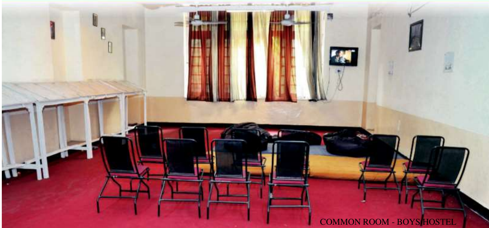
COMMON ROOM - BOYS HOSTEL