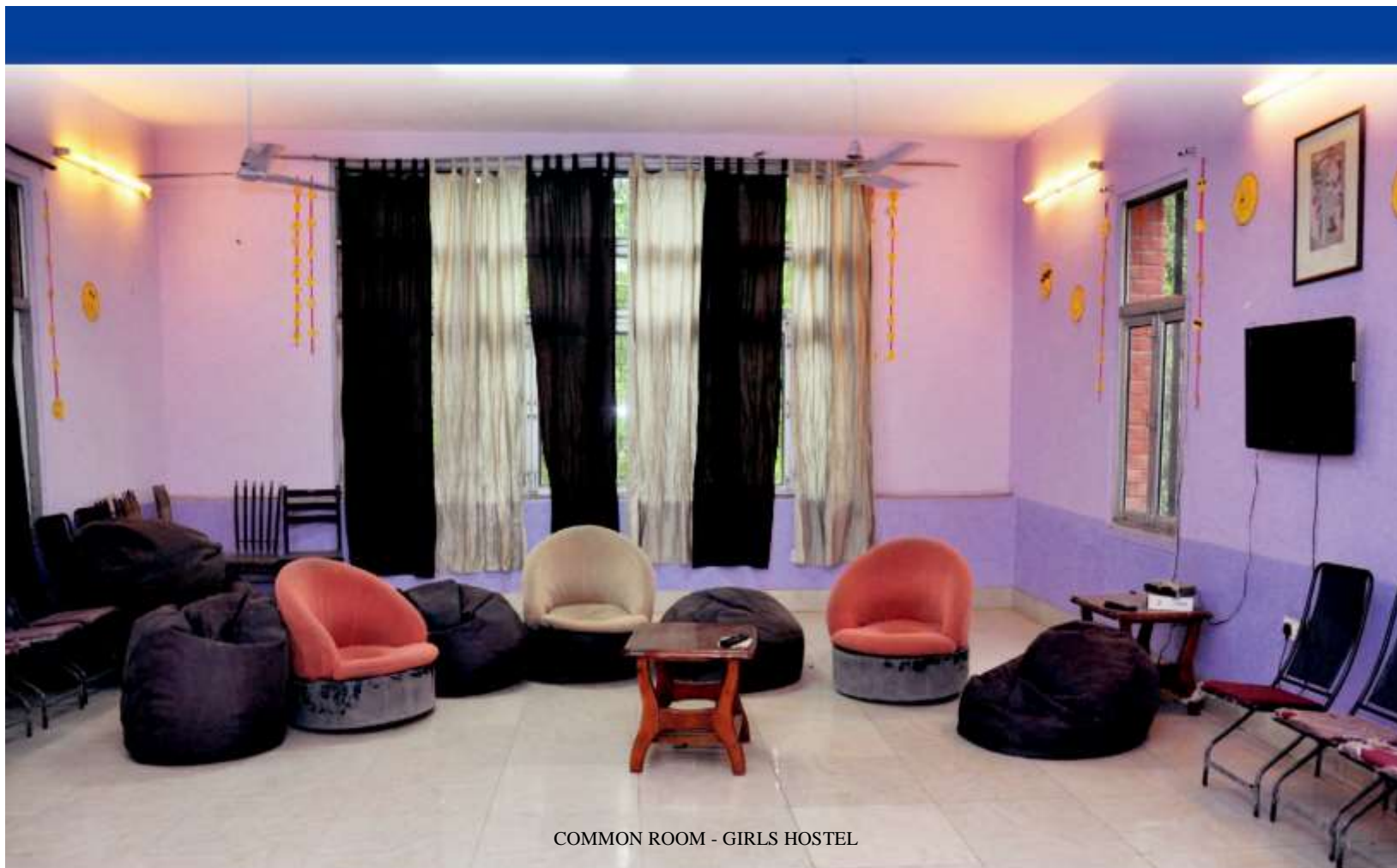
COMMON ROOM - GIRLS HOSTEL

charges are given functional autonomy with full sense of responsibility. They will discharge their functions in consultation with the Batch Representatives and Mess Committee Members keeping in mind the interest of residents.