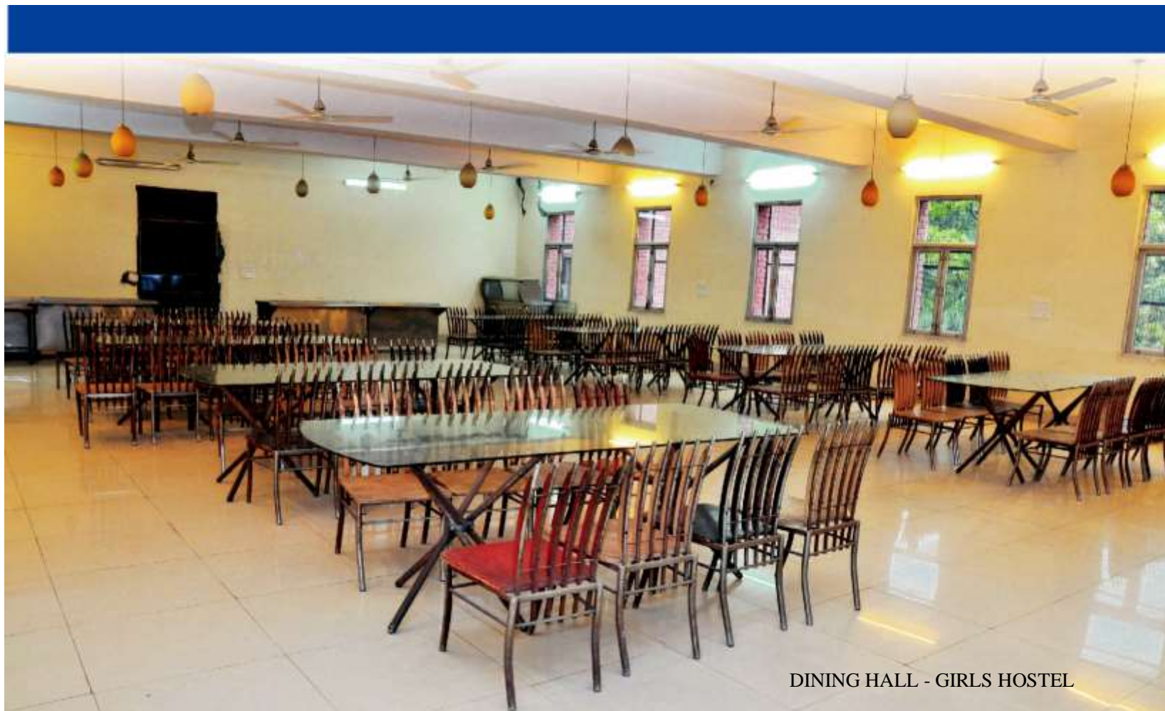
DINING HALL - GIRLS HOSTEL