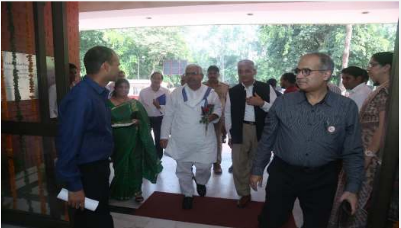
Hindi Mahotsav Celebration