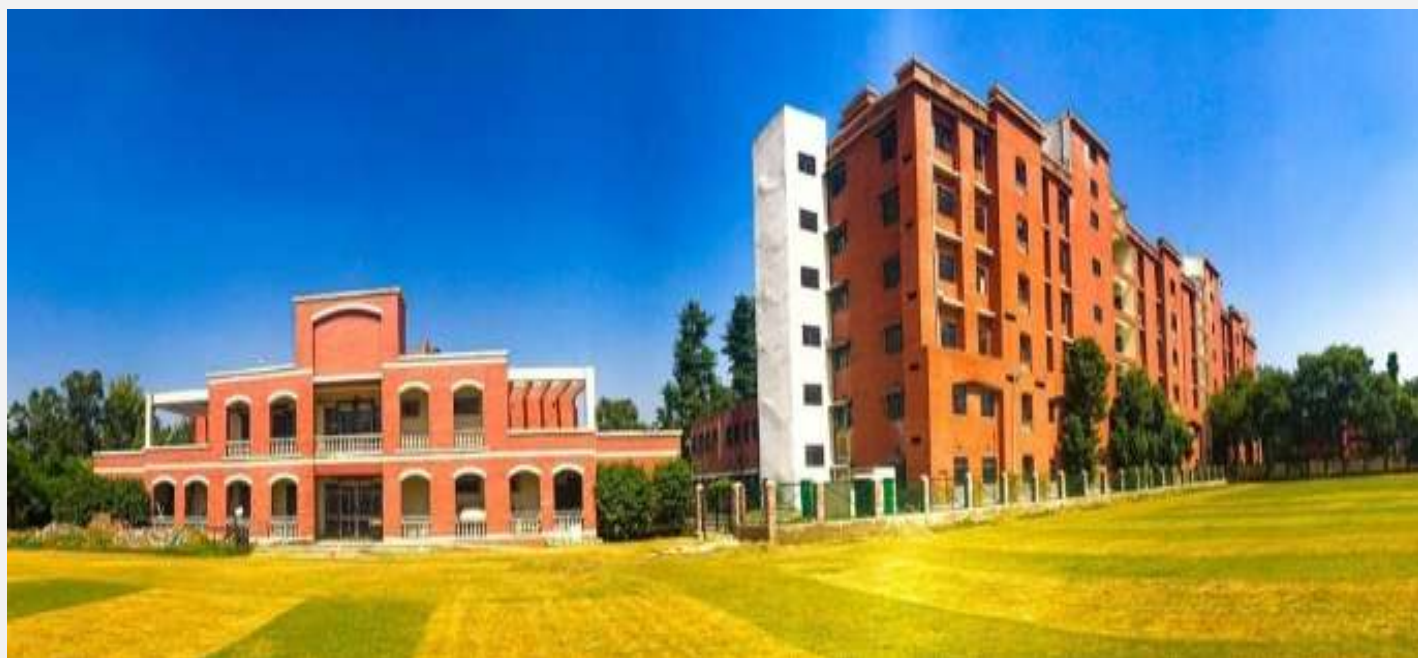
Sports Complex and New Teaching Building: A view from sports ground