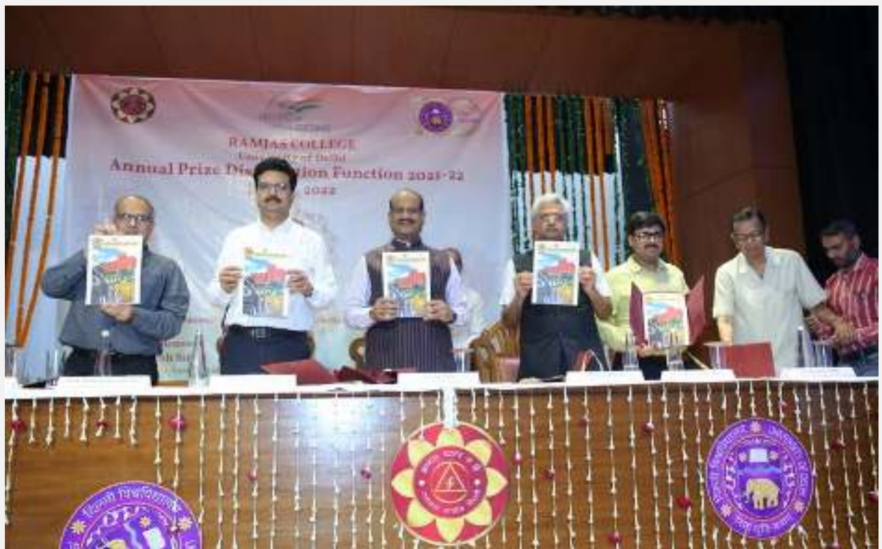
Annual Prize Distribution Function