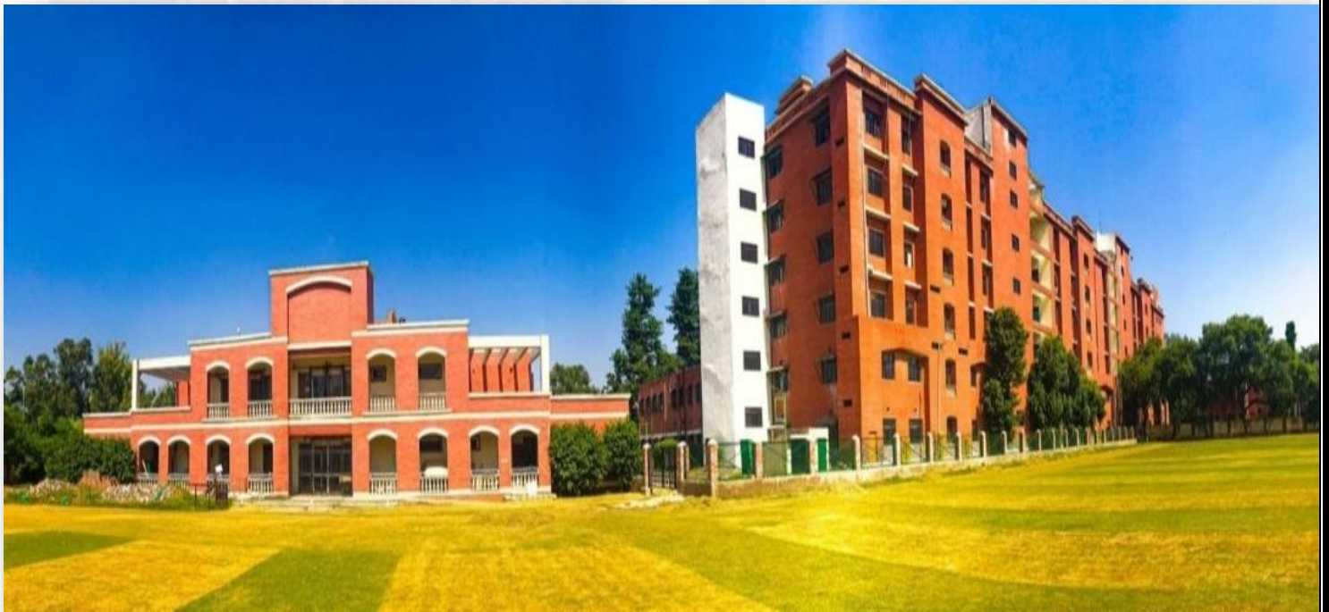
SPORTS COMPLEX AND NEW TEACHING BUILDING: A VIEW FROM SPORTS GROUND